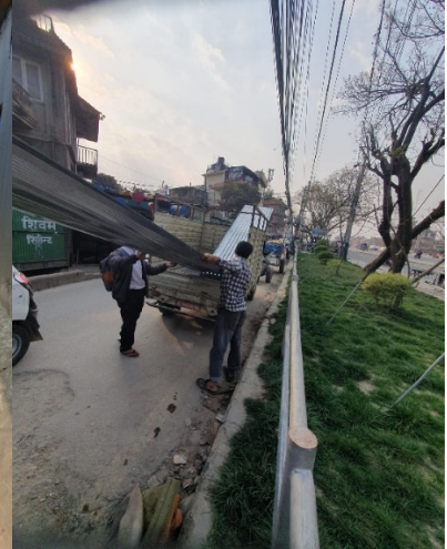
Collecting tin sheets