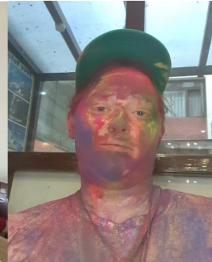
Me after Holi celebrations